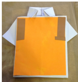
Finn Father's Day origami shirt