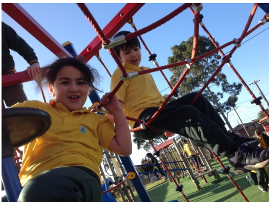
Outdoor fun in the sun