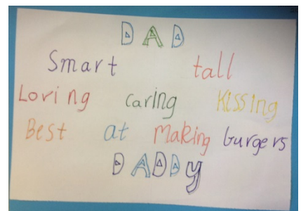
Iman Card and poem